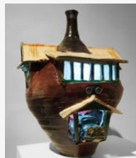
Ian Whittaker QUEENSLANDER

Australia-wide. Entry forms for Melting Pot 2020 are available now from the Cairns Potters Club website or by contacting Lone White (07 4053 7508 or lone@tpg.com.au ).